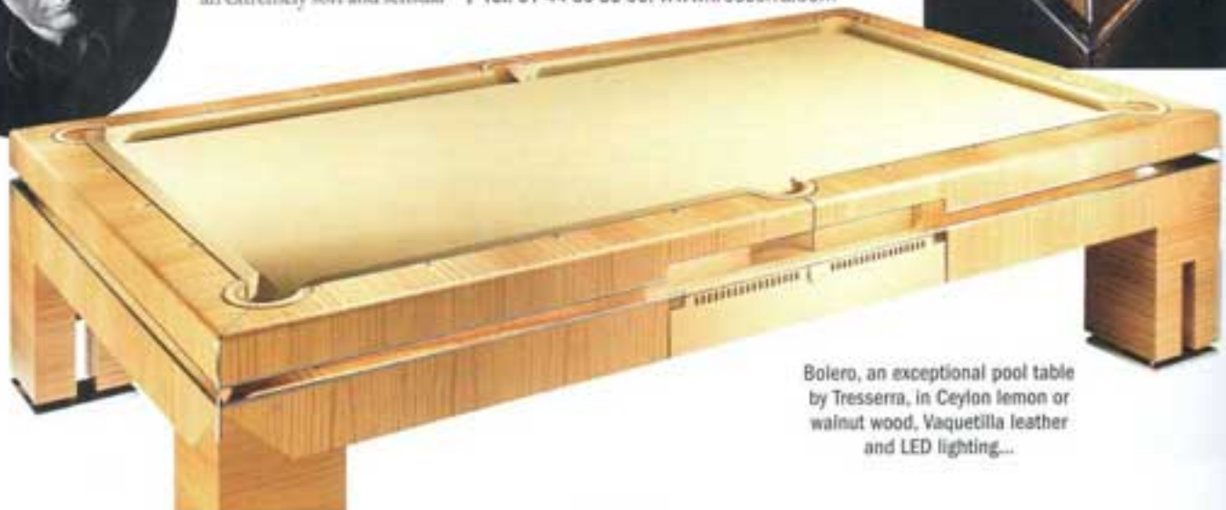
Bolero, an exceptional pool table by Tresserra, in Ceylon lemon or walnut wood, Vaquetilla leather and LED lighting...