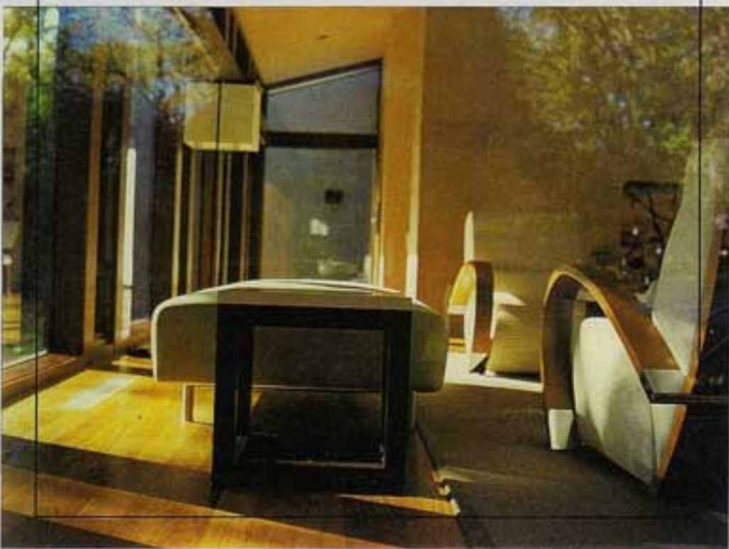
Left: The slope of the house's roof can be seen in the clerestory window. "The geometry of the space was derived from the site," says architect Svend Fruit. "The important aspects of this house are the site and the views — inside and out. We wrapped the windows on all sides so there is a more natural view. And with a house with so many windows, the exterior becomes the interior color palette. Large overhangs keep out direct sunlight, but there is still a lot of light coming in. So we used richer materials like teak on the floors and mahogany on the windows to absorb the brightness. While there is a lot of white, it's not a crisp white box."