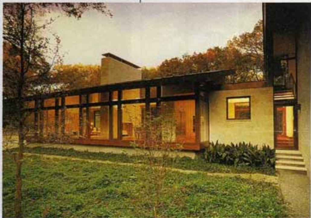
Right: The house, designed by architect Svend Fruit of Bodron+Fruit, was completed in early 2002. "To me, 'modern' means a house incorporates everything, from the site it's built on to the way the owners live," says Fruit.

Tailored as tautly as a bespoke suit, the house is a deceptively simple pavilion.